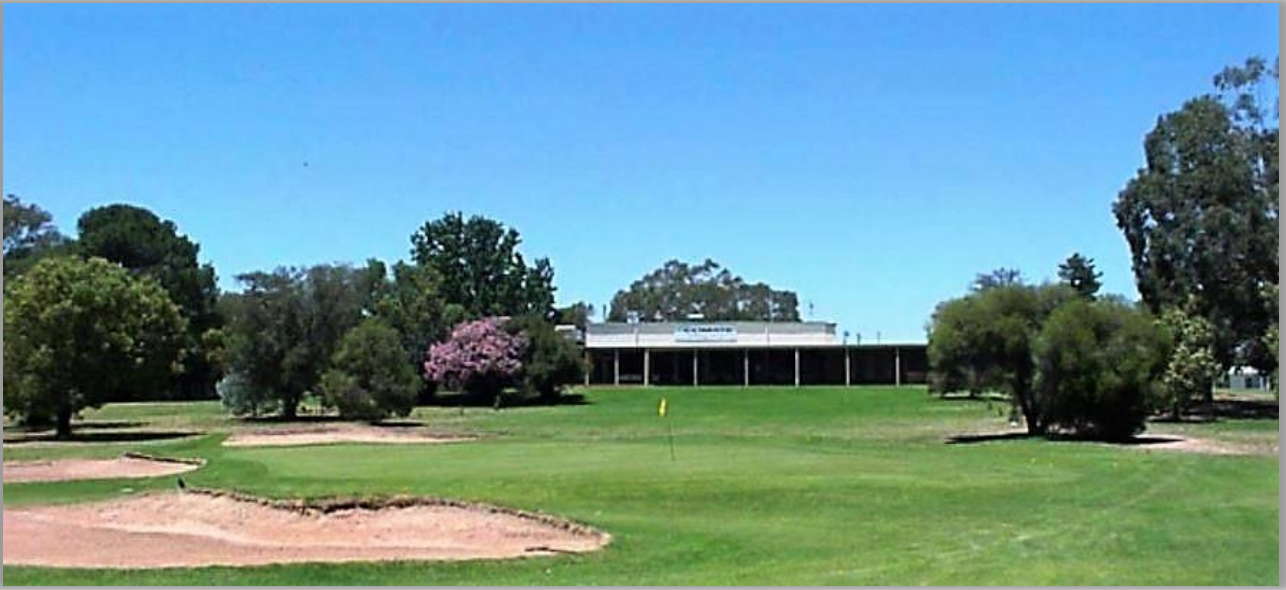
Present day view of 18 th green & Club